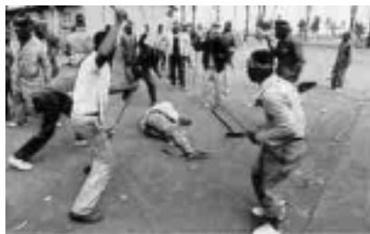
Rioting during the Apartheid era in South Africa

Great Britain assumed control of South Africa in 1795, after the Napoleonic Wars in Europe. The Dutch settlers were