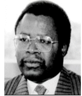
Samuel K. Doe

Tolbert was killed in a 1980 coup led by Samuel K. Doe, who opposed the privilege of the Americo-Liberians. Doe brutally ruled Liberia for ten years until being killed by rebel forces. A civil war is a war within a nation, as opposed to a war with other nations. Liberia's civil war lasted from 1989 to 1997, when military strongman Charles Taylor sealed his control over the nation. Civil strife has destroyed much of Liberia's economy and caused business people to leave the nation. Liberia's recent history is a sad chapter for a nation whose founding was steeped in freedom.