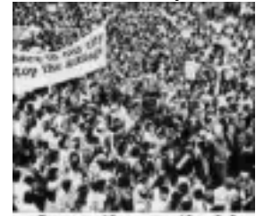
An anti-apartheid rally in South Africa

unhappy with British rule and became even angrier when the British outlawed slavery in 1835. The British government paid owners for their slaves, but the Boers complained the payments were too small. The British outlawed slavery twenty-three years before the United States. Gold and diamonds were discovered in South Africa in 1867, causing a large number of people from Great Britain to move to the colony. Tensions between the parties led to the "Boer Wars" from 1899 to 1902, where the British soundly defeated the Boers.