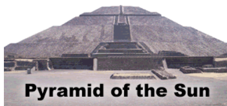
Pyramid of the Sun